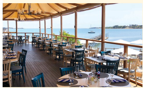
Outer Bar e3 Grille

In-Room Dining is available 7am to 9pm. Or we'll arrange for your order to be served on your deck or patio, or an outdoor area of your choice.